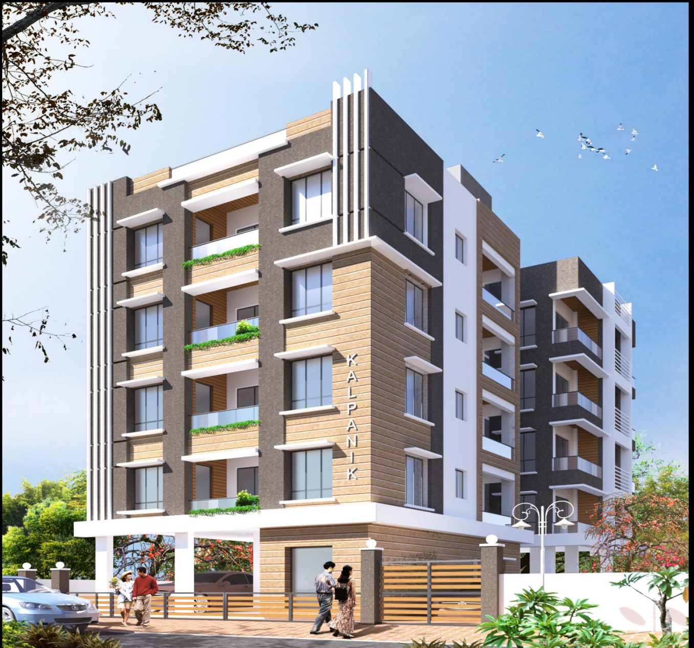
PROPOSED G+IV STORIED RESIDENTIAL BUILDING OF KALPANIK CO-OPERATIVE HOUSING SOCIETY LTD. AT NEW TOWN, KOLKATA